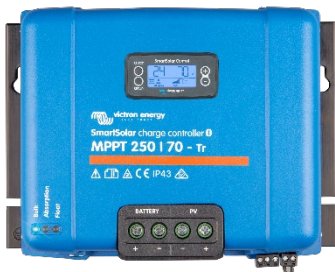
SmartSolar Charge Controller MPPT 250/70-Tr with optional pluggable display