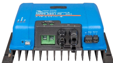
SmartSolar Charge Controller MPPT 250/70-MC4 without display